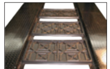
Three (3) Drip Trays