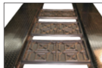
Four (4) Drip Trays